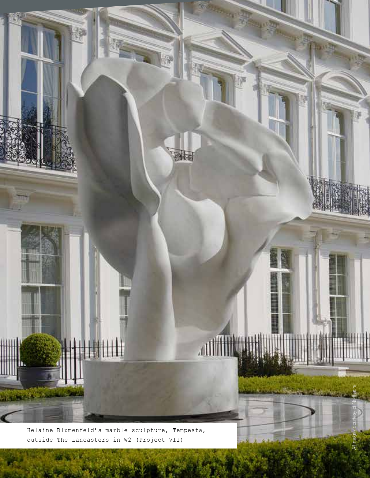
Helaine Blumenfeld's marble sculpture, Tempesta , outside The Lancasters in W2 (Project VII)