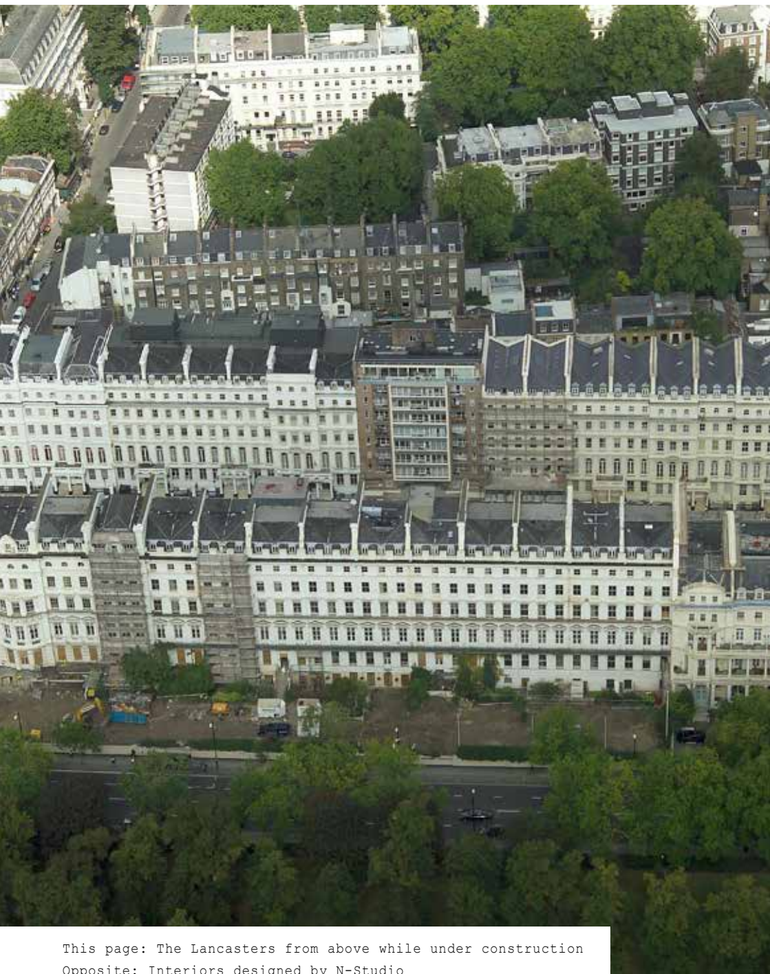
This page: The Lancasters from above while under construction Opposite: Interiors designed by N-Studio