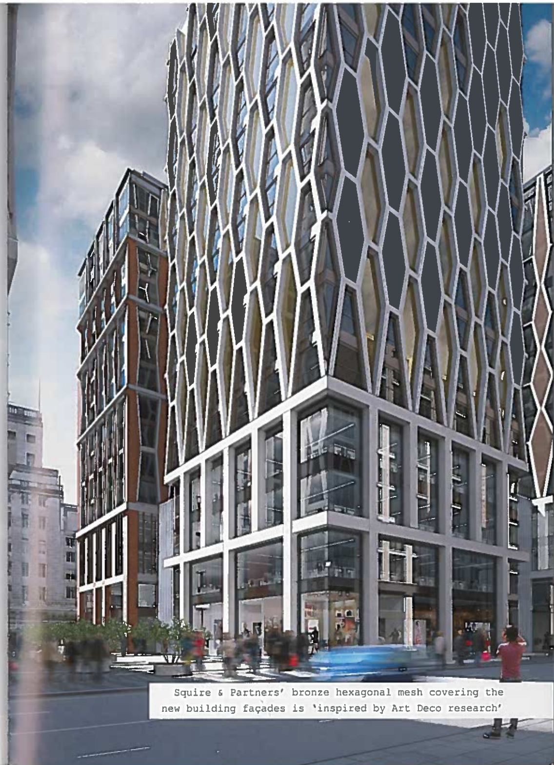
Squire & Partners' bronze hexagonal mesh covering the new building façades is 'inspired by Art Deco research'