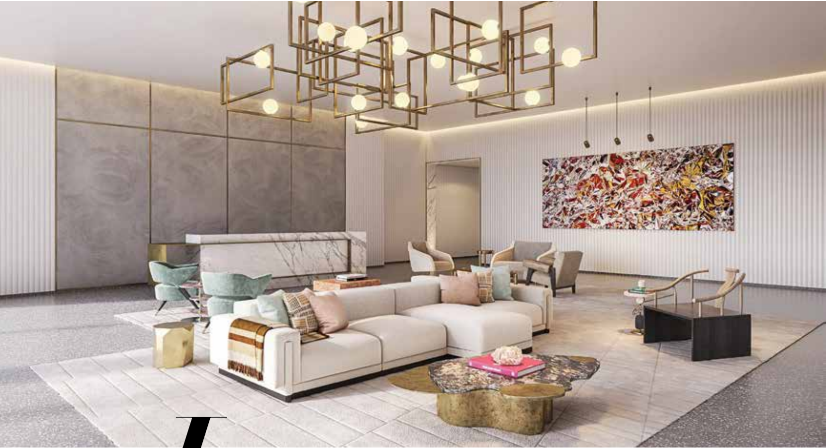
An interior view of The Broadway