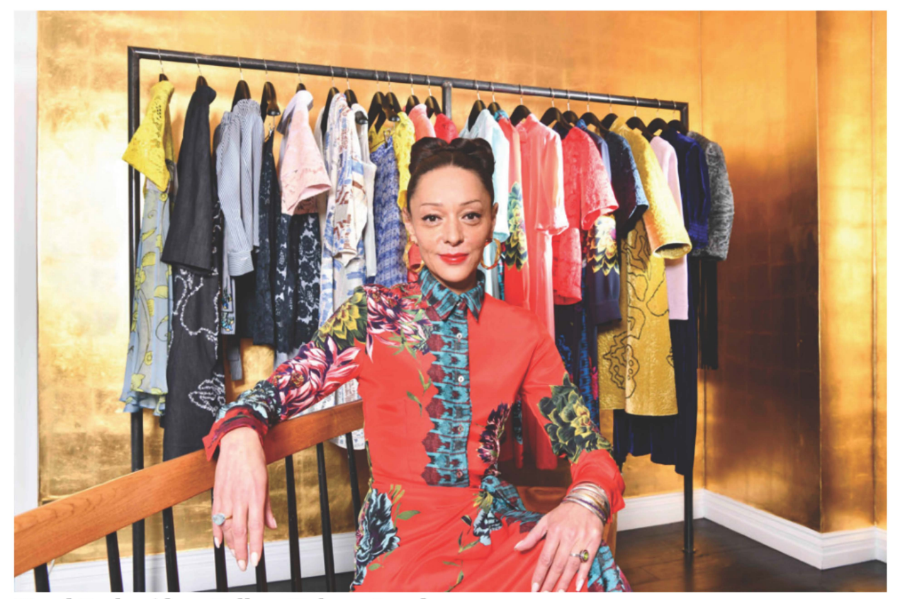
Hand Embroidery Talk at Kokoro London

Guests will be able to learn the traditional Japanese art of Boro led by London-based sewing school and fabric shop, Ray Stitch. During this workshop, visitors will explore the history behind this technique and use layers of TOAST cloth and thread to stitch together a boro-inspired textile or will be able to repair or strengthen an item of clothing. 11 May, every hour 2pm-6pm. 191 Westbourne Grove, London, W11 2SB. Booking via toa.st.