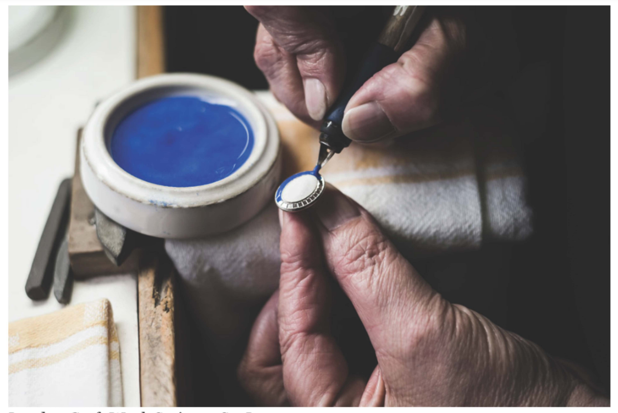
London Craft Week Series at St. James

St James's London will host a programme of events and demonstrations celebrating outstanding British and international creativity. The secrets of essential knitwear and an exclusive preview of John Smedley inspired pieces will be revealed at John Smedley. There will also be a pottery masterclass in Tissue Transfer by Burleigh, a selection of precious metal and silver pieces curated by the Goldsmith's Company at Fortnum & Mason and many more. 9-13\,May .